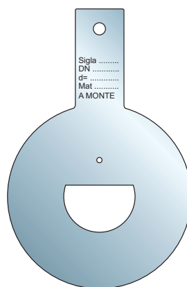
- Segmentale - Segmental

Fori di spurgo e sfiato Drain and vent hole